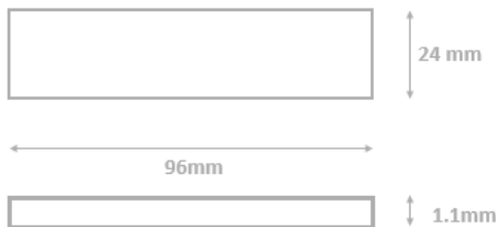
Dimensions stated in mm Supply format = 500 labels per roll