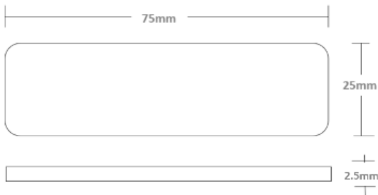
Dimensions stated in mm