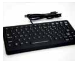
Fully Sealed Keyboard