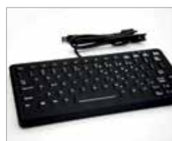
Fully Sealed Keyboard