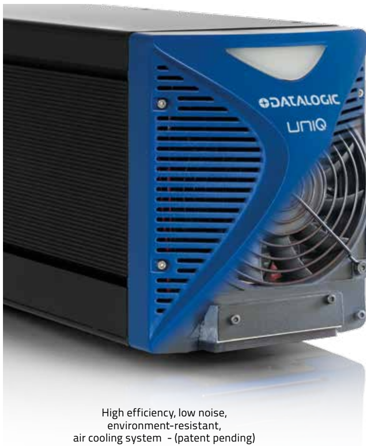
High efficiency, low noise, environment-resistant, air cooling system - (patent pending)

Laser interaction with organic or inorganic material can cause TOXIC FUMES/PARTICLES. The OEM laser components described in this product guide is for sale solely to qualified manufacturers, who shall provide interlocks, indicators and other appropriate safety features in full compliance with applicable national and local regulations.