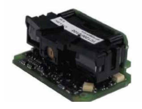
TC1200 SCAN ENGINE MODEL