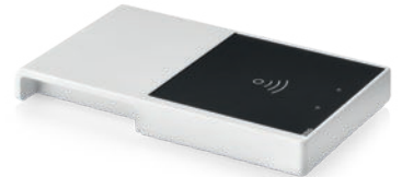
ID CPR30pro / ID CPR30pro SAM