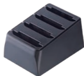
Multi-slot Battery Charger